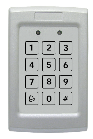
AY-Q55 Pin Reader Piezoelectric Keypad