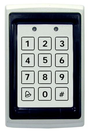
AY-Q65 Prox & Pin Reader Piezoelectric Keypad